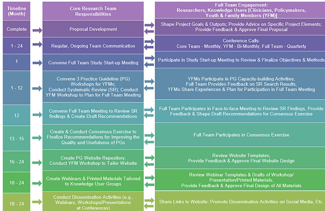
Figure 1 Team members will conduct their work over a 24-month period as described in the steps shown.

in order to strengthen PG quality and usefulness, and reduce duplication?